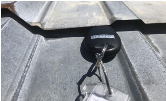
Horizontal seams separating