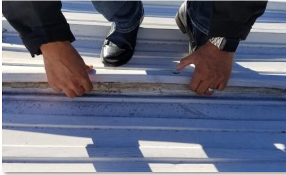
Vertical seams separating