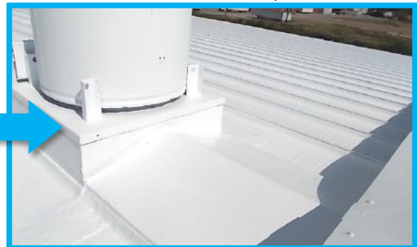
Attention to detail