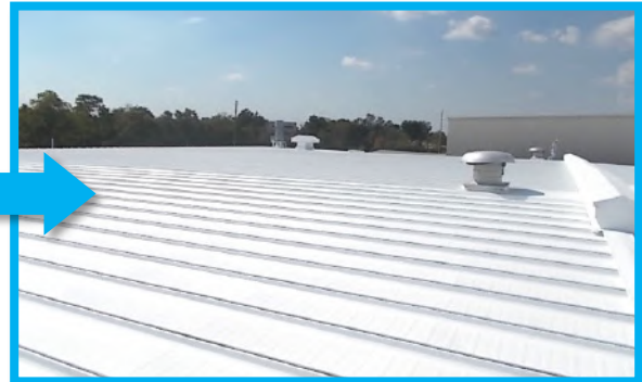
Entire roof receives multiple coats of ASTEC Finish