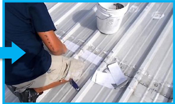
Fully reinforce horizontal seams