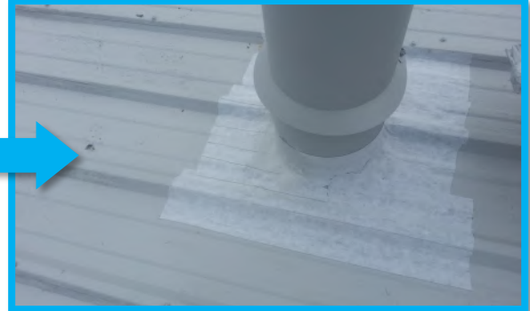
Seal and waterproof penetrations