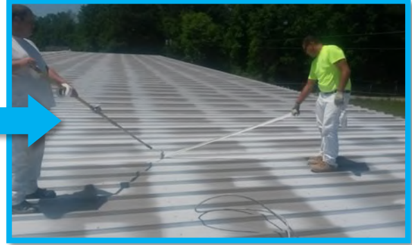
Fully reinforce vertical seams