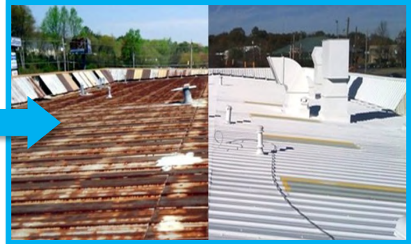
Treat rust to prevent further rust formation