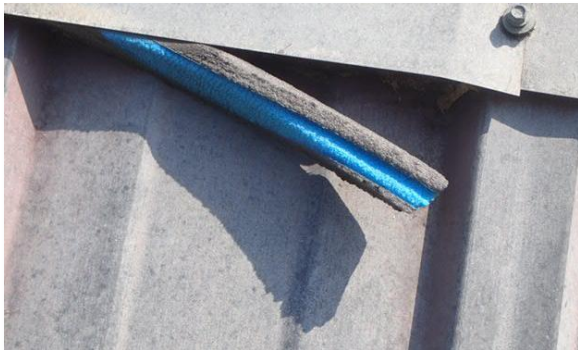
Loose or missing foam inserts