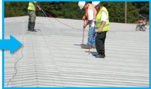
Tighten/replace fasteners and pressure wash and clean