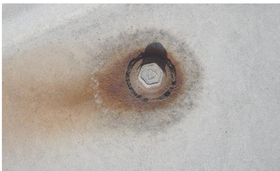
Failing fastener grommet