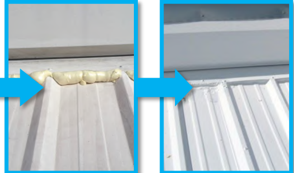
Foam, trim, seal and waterproof open voids