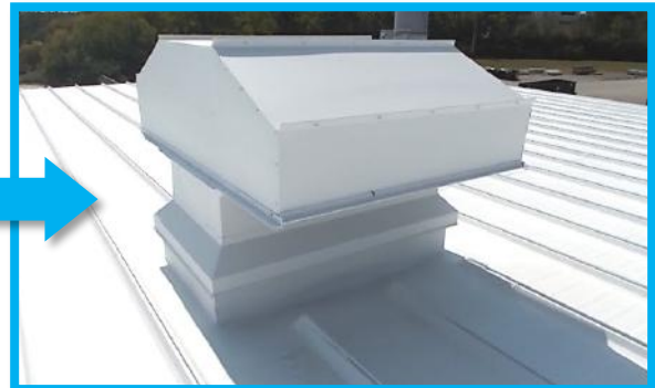
10 or 15-year renewable product and labor warranty