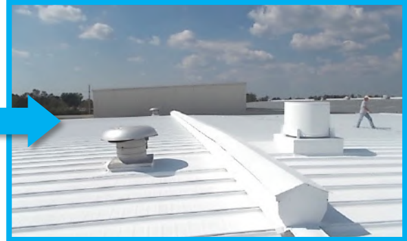
Seamless monolithic system