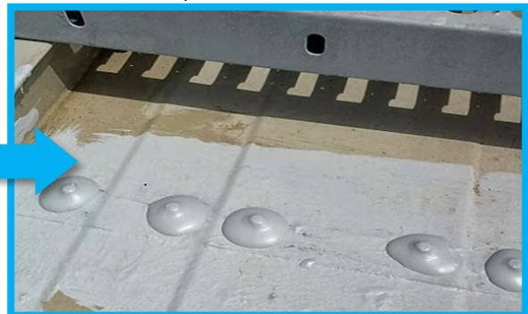
Encapsulate and waterproof fasteners